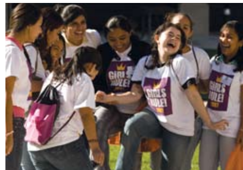
Crittenton Services of Greater Washington's GIRLS RULE! Conference inspires laughter and builds self-esteem among teens, who also establish long-term goals for school, work and life.

Imagine the power to change the course of a family's future by helping a woman emerge from debt into a lifetime of financial security. Imagine the power to provide the training to move a single mom from a dead end job into a promising career. Imagine the power to turn committed citizens into a savvy, knowledgeable network of philanthropists with the ability to change lives and their community. Together, we're changing the lives of women and girls, and building a stronger community.