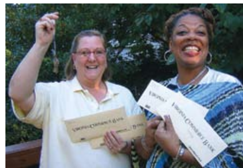
Recent graduates of Friends of Guest House's residential program for formerly incarcerated women proudly display their first bank accounts and keys to their apartments.

In 2007, The Women's Foundation's total revenue remained consistent with 2006 at $2.8 million. Revenue from corporate investors and foundations increased nearly $1 million, representing continued efforts to raise philanthropic dollars from diverse revenue streams. The Women's Foundation provided direct grants of $1.1 million in 2007, representing 35 percent of total expenses and a 7 percent increase in grants to nonprofit organizations from 2006. The Women's Foundation continued to dedicate the majority of its funds to its grantmaking and capacity building programs for nonprofit organizations, which was 89 percent of total expenses for the year and a 27 percent increase from 2006. The Stepping Stones initiative continued to be a significant focus of The Women's Foundation's grantmaking and programmatic work.